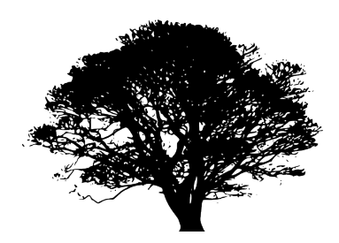
tree audio / los angeles